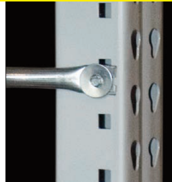
Easy for maintenance personnel to install... requires no special tools or skills