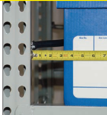
Provides 3" clearance between rack and boxes