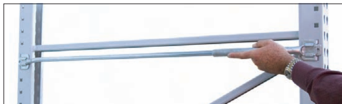
Spring-loaded Fluekeeper is easy for maintenance personnel to install from the aisle side of the rack - requires no special tools or skills

NEW FlueKeeper from DACS -Patent Pending-