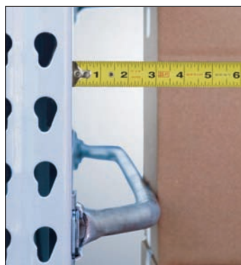
Provides 3" clearance between rack and stored material