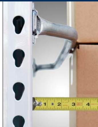
Provides 3" clearance between rack and stored material