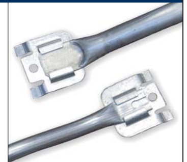
Boltless Front & Rear connections make installation possible without removing any items