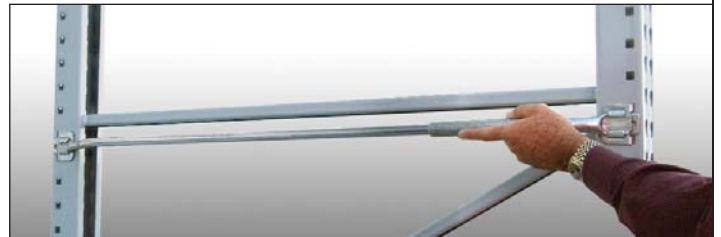
Spring-loaded Fluekeeper is easy for maintenance personnel to install from the aisle side of the rack - requires no special tools or skills

FlueKeeper from DACS US Patent #7,857,152